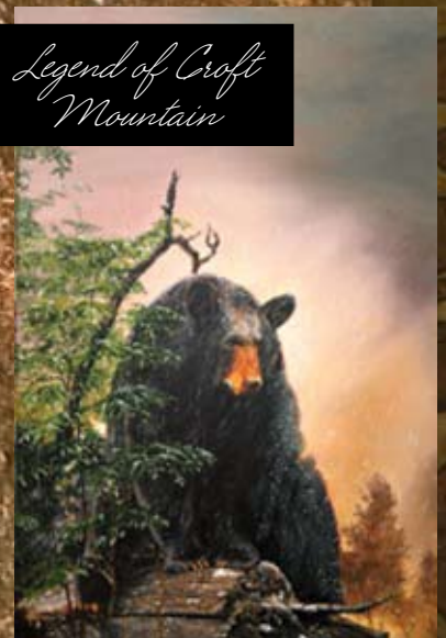
Legend of Croft Mountain