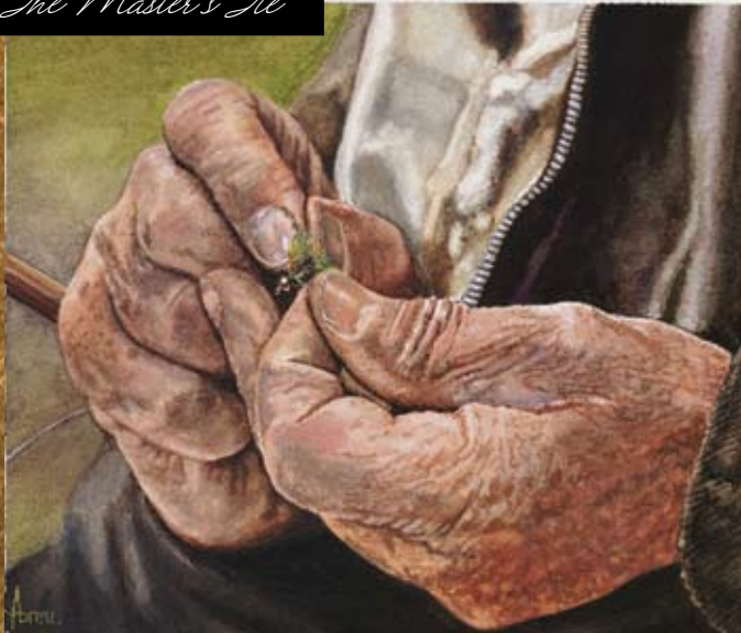
The Master's Tie